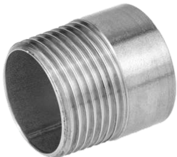
Tronchetto Gas a saldare Welding stubs

DN 1/4" 3/8" 1/2" 3/4" 1" 1" ¼ 1" ½ 2" 2" ½ 3" 3" ½ 4"