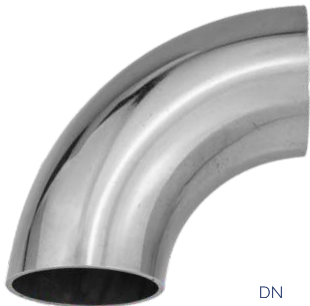
Curva 90° a saldare 90° welding bend