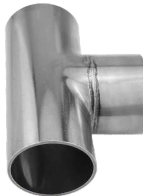
Tee a saldare Welding T union