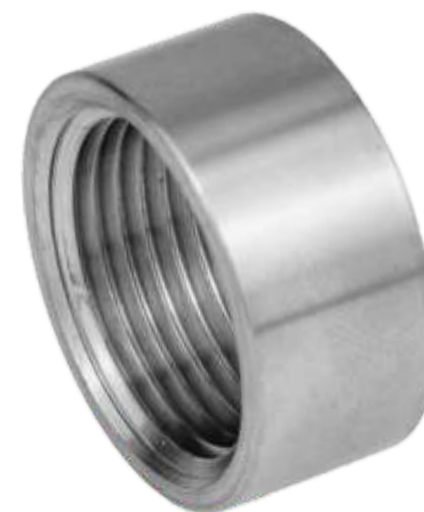
Manicotto Gas a saldare Welding sleeves

DN 1/4" 3/8" 1/2" 3/4" 1" 1" ¼ 1" ½ 2" 2" ½ 3" 3" ½ 4"